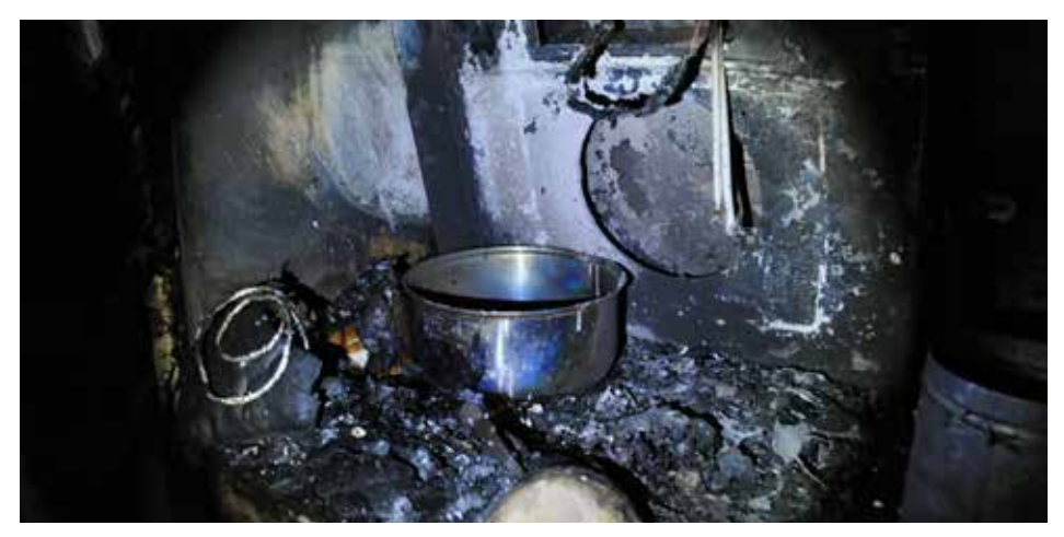
Do not use the stove when you come home from a night out.

extinguisher. The extinguishing equipment must be mounted so that it is easily available. It must be checked regularly.